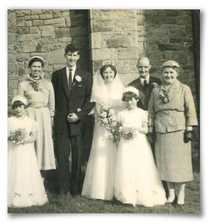
6th October 1956